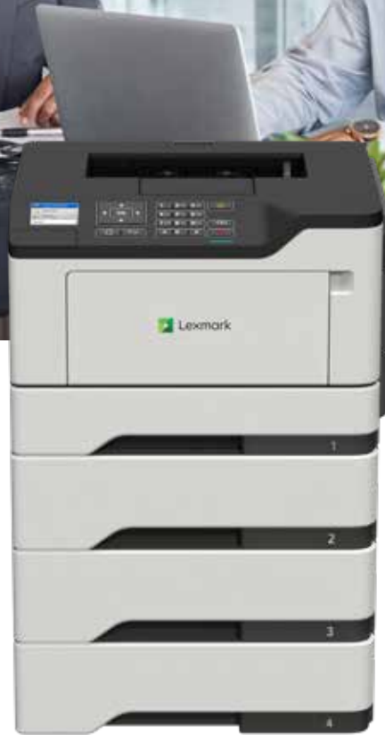
M1246 with optional trays