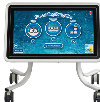
Early Years Interactive Touchscreen Table

The tables come with the ability to install a range of optional award-winning educational apps by Yellow Door. The apps cover key areas of the curriculum, including: numeracy, literacy, sensory, emotional wellbeing and pre-coding keeps children engaged in teaching and learning content.