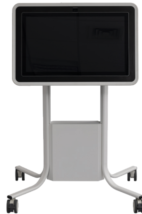
Agile Interactive Touchscreen Table

With three unique products in the range, each is an easy-to-use mobile screen product designed to give you more flexibility than a dedicated meeting space, or to increase engagement in activities or learning. By making use of market-leading touch technology, the products allow up to 40 simultaneous touchpoints, making them ideal for individual or group use.