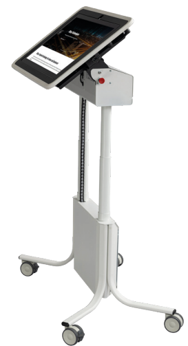
Flex Interactive Touchscreen Table

The Flex Interactive Touchscreen Table works in exactly the same way as Agile. As the name suggests, Flex comes with the added flexibility of using the device vertically or horizontally, and is also height adjustable. So it doesn't matter if you want to work seated or standing, the table can adapt to your needs.